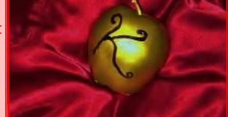
Golden Apple by Ajna DreamsAwake

The Apple is inscribed with the word Kallisti which means "To the fairest" or "To the prettiest". But the Apple can just as easily mean to the richest, the most powerful, the chosen. People's true colors come out when they attempt to take the Apple for themselves. People will see what they want to see within the Apple, and will do anything to keep it for themselves, including having power over others and trampling peoples rights.