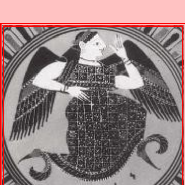
Winged Eris

Eris, in Her role as Defender of the People, may have roots in a pre-patriarchal society which valued the chaotic nature of this Goddess. Eris may have originally been an aspect of a Triple Goddess of Fate along with Her Sisters, Philotes (Affection) and Nemesis (Vengeance). She is associated with the Tree of Hesperides (the source of Her golden apples). The serpent coiled in Her hair is a symbol that links Her to a much older Deity. Eris is sometimes depicted as a black-winged Goddess with claws replacing her feet, conjuring up images of Lilith or Inanna, and other maligned and feared Dark Goddesses.