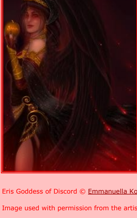
Eris Goddess of Discord © Emmanuella Kozas

Image used with permission from the artist